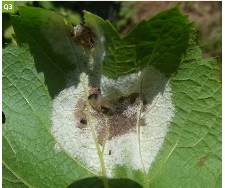
Active viable downy mildew oilspots will show the characteristic fresh white down in the morning after the bag test.