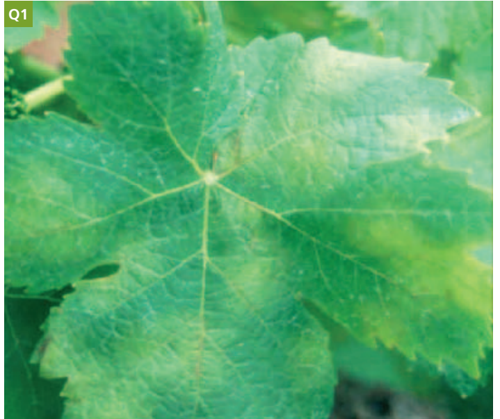
Oilspots are circular and light yellow when young